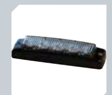
Front & Rear Hazard Lights