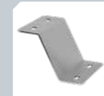
100mm & 150mm 'Z' Shaped Brackets