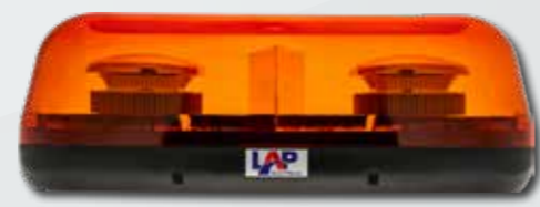
CLBT162A 400mm compact lightbar also available (see page 59).