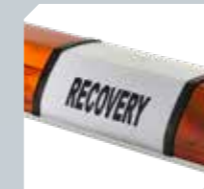
Opaque/Illuminated Centre & Signage