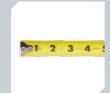
Lengths from 2ft to 6ft