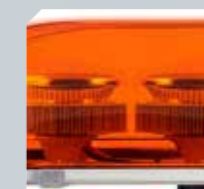
Two or four LED head options