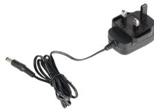
1PC British Adapter