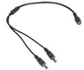
1PC 1 to 2 DC Plug Cable