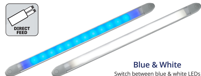
Blue & White