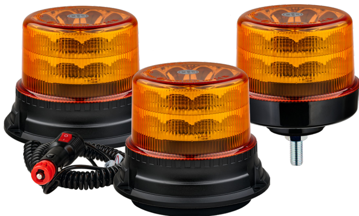
A-ELPB050-2 3-Point Fixing